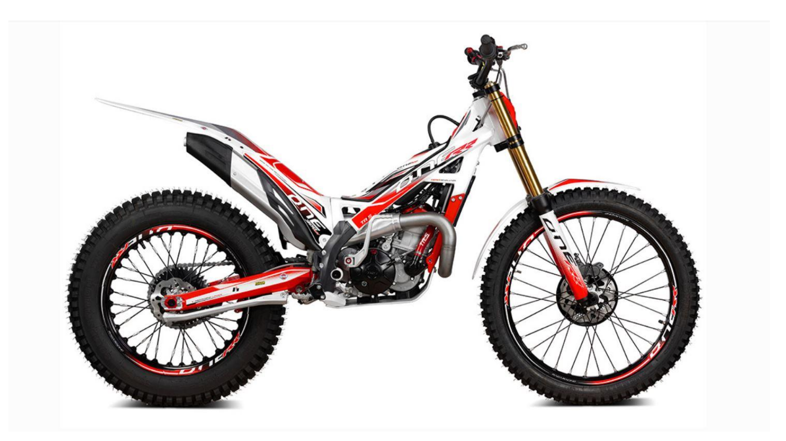
2024 TRS One RR (available soon)

TRS - TRS was officially established in 2013. They began by offering 250, 280, and 300cc trials bikes. Today they also offer a 125cc. Located in Barcelona, Spain; TRS has really taken off as one of the top Trials bike brands. TRS is the bike of choice for multi X-Trials Champion Adam Raga.